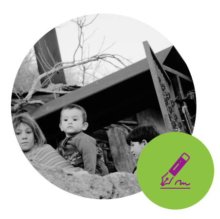
Policy recommendations to provide guidelines for policymakers to increase access to affordable, inclusive and sustainable housing for marginalised groups in society.